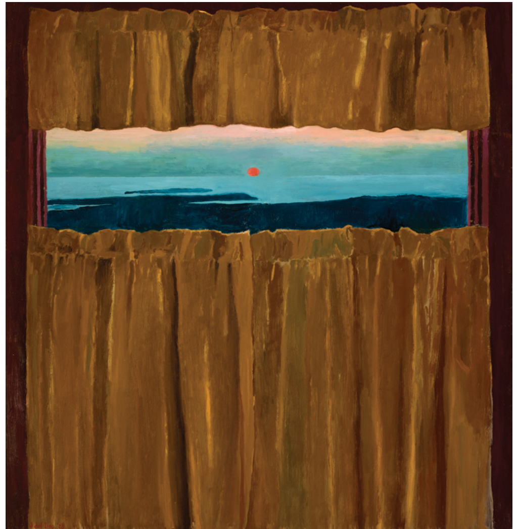
CURTAIN WITH PINK DOT 2023