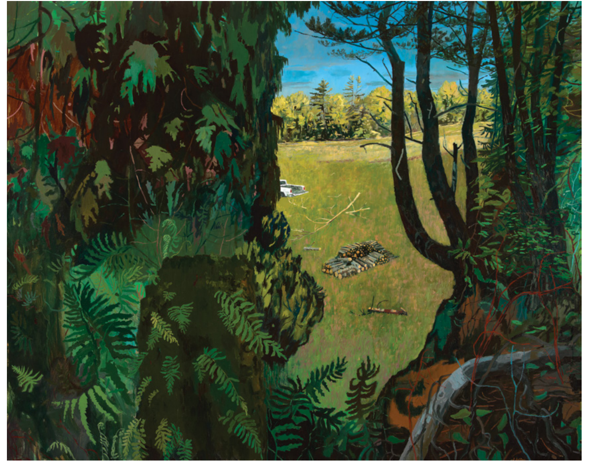
NATURE SEES YOU 2019