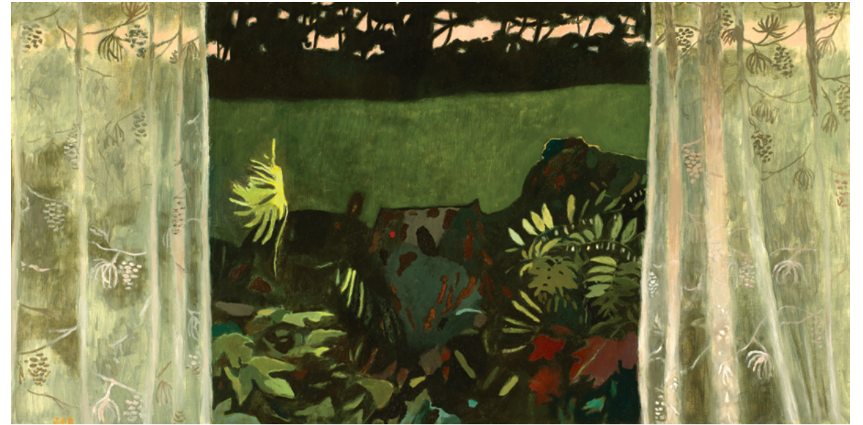
EVENING WINDOW 2022