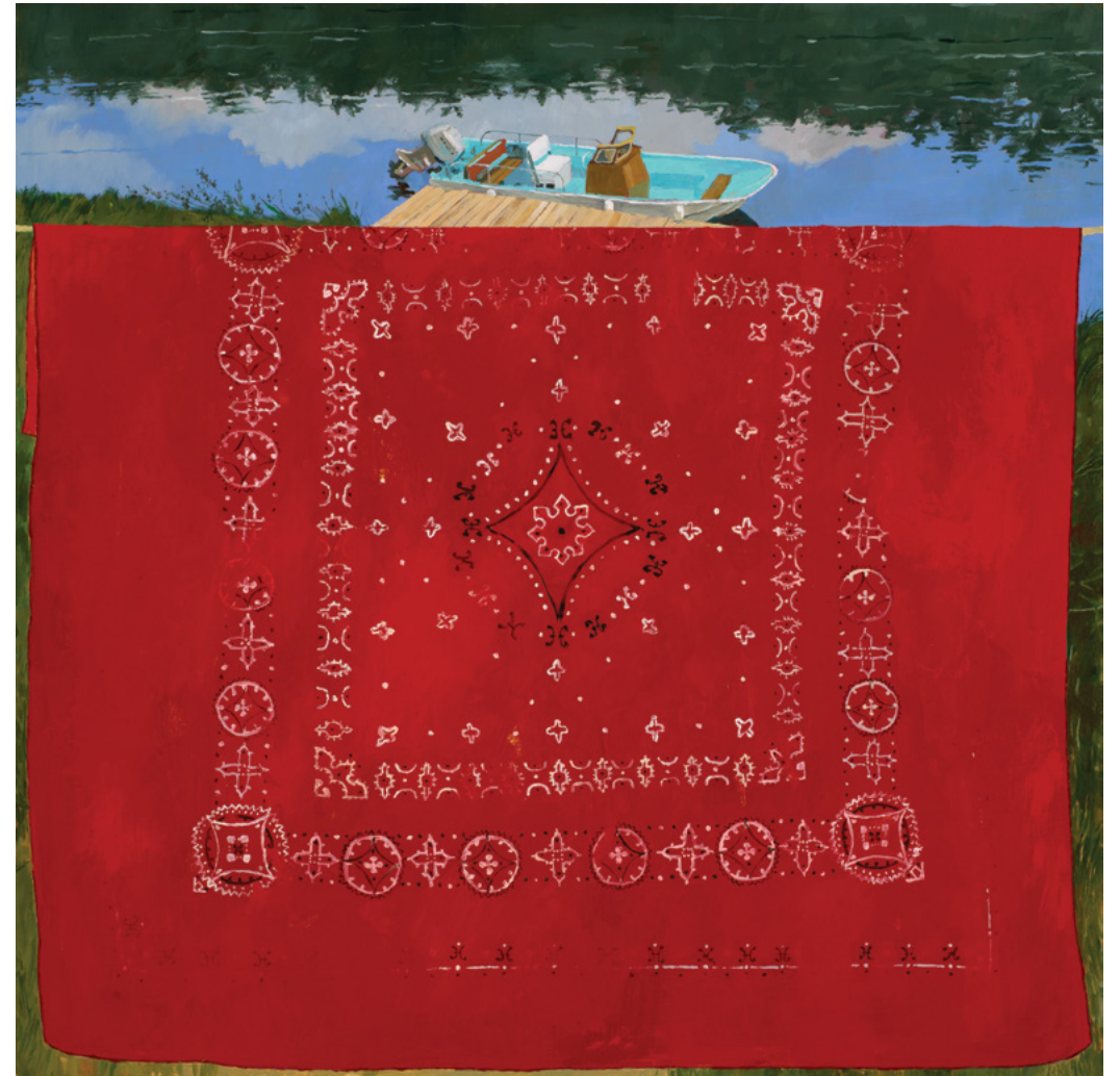
SPRUCE CREEK (RED BANDANNA) 2021