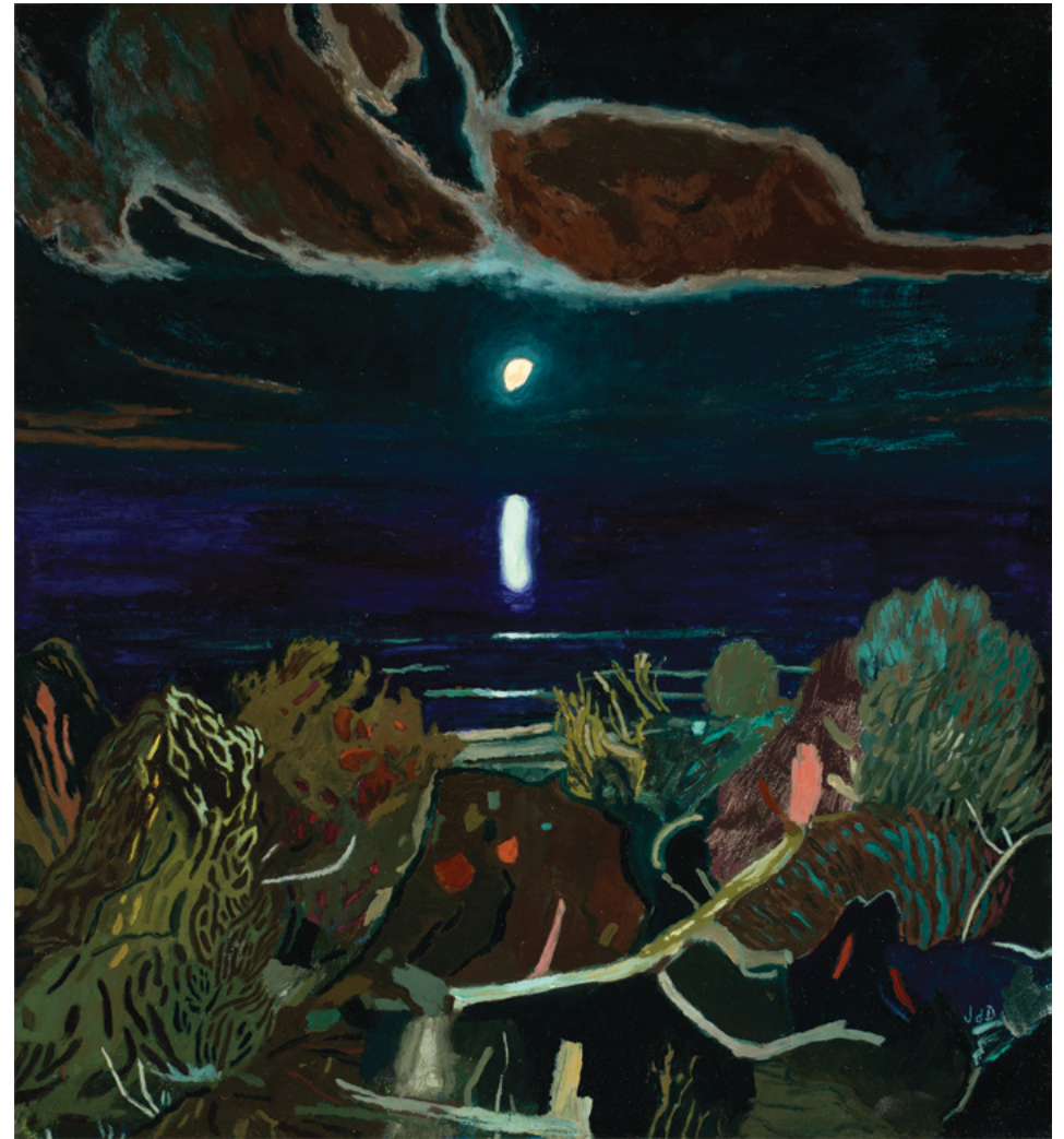
5/8THS MOON 2023