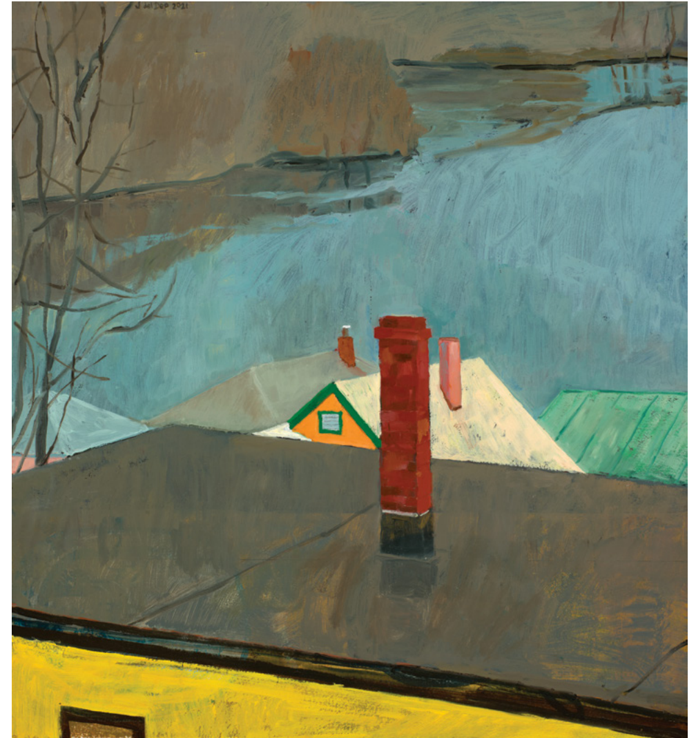
THREE CHIMNEYS 2021