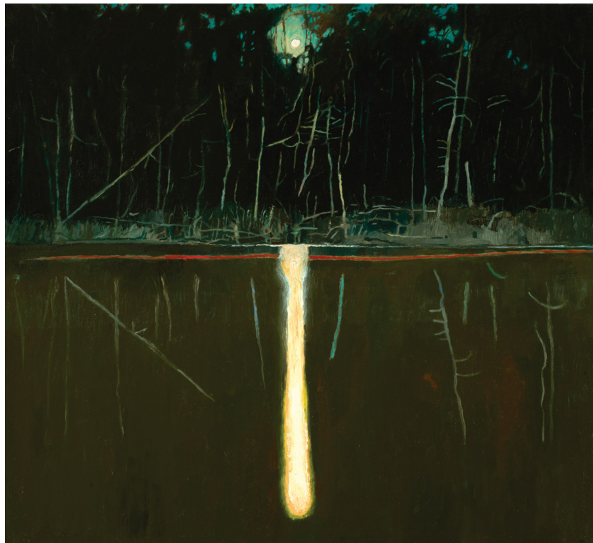
RED LINE ON SKELETON POND 2023