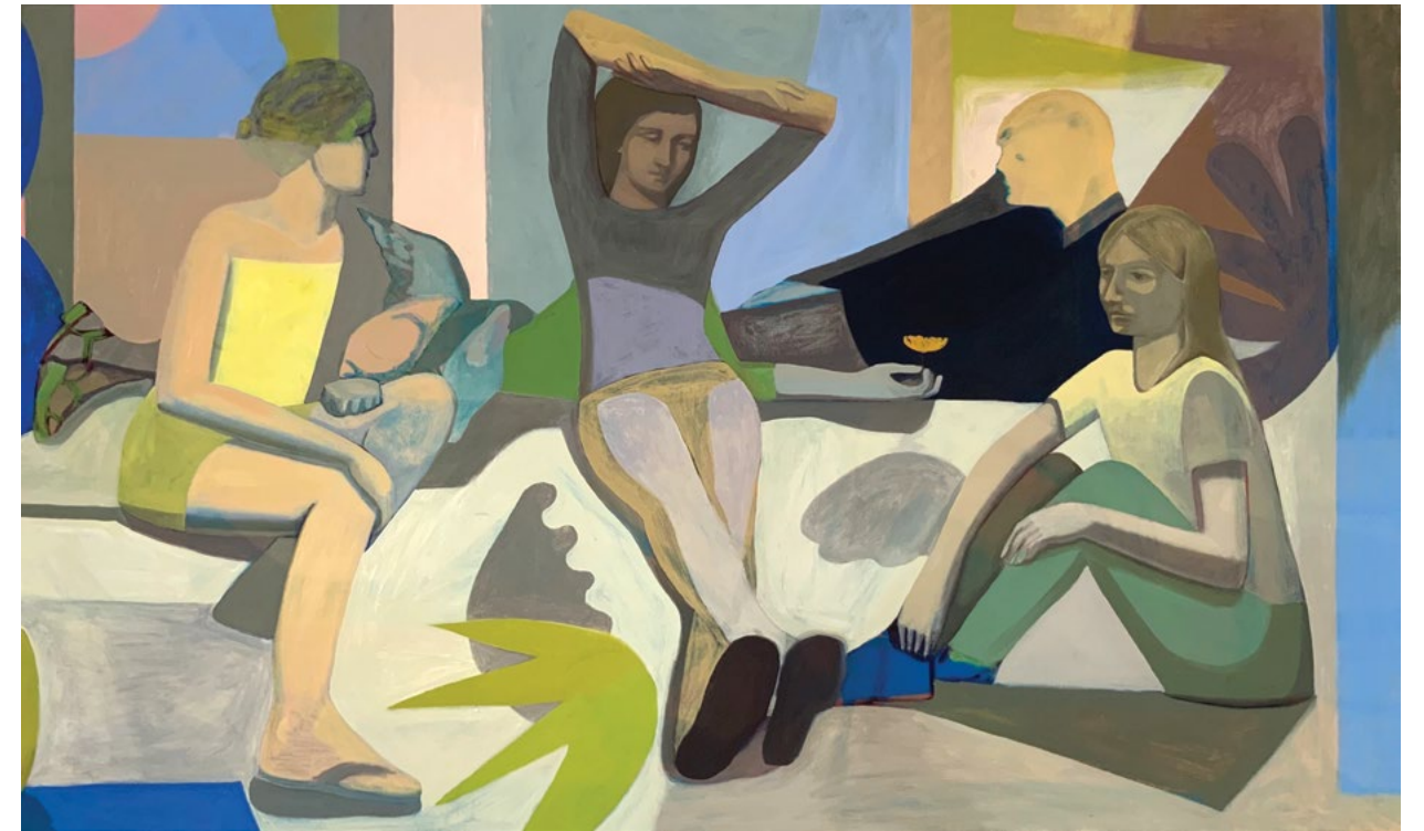
FRONT PORCH, 2020